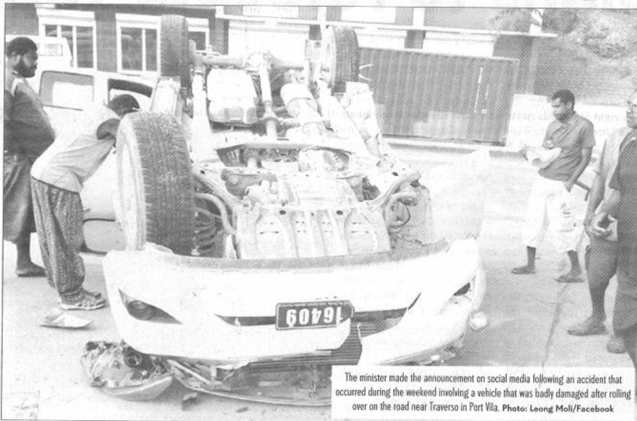
The minister made the announcement on social media following an accident that occurred during the weekend involving a vehicle that was badly damaged after rolling over on the road near Traverso in Port Vila.

Last Saturday's accident has raised concerns that drivers fail to take the golden rules of driving seriously.